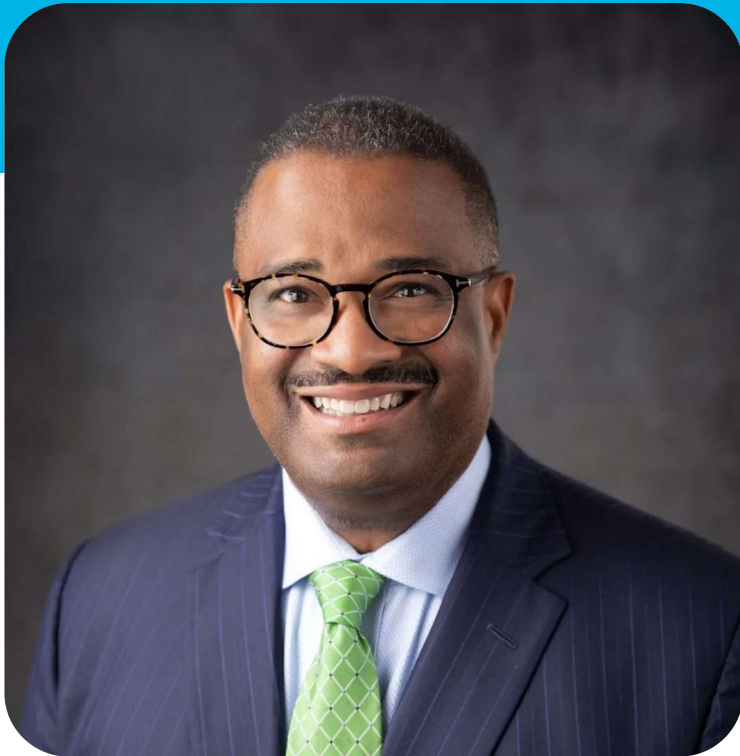
Mayor Garnett Johnson